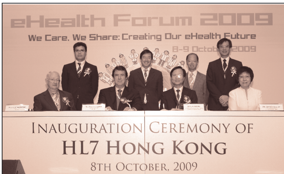
Official inauguration ceremony of HL7 Hong Kong