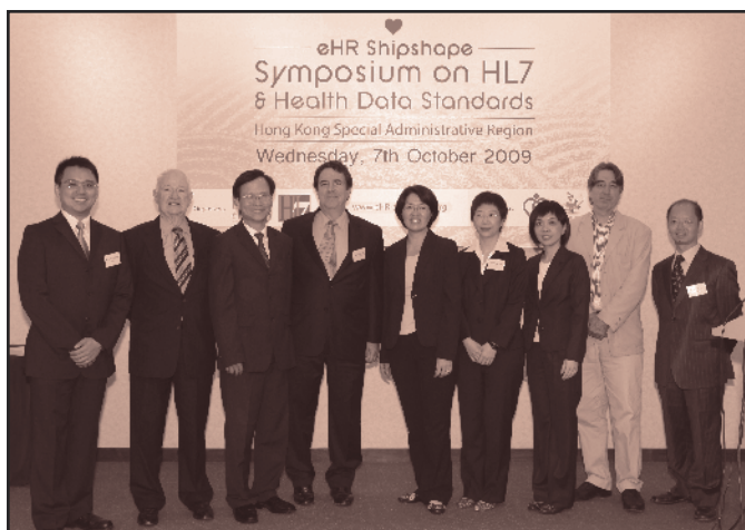
Organizers and invited speakers at the eHR Shipshape Symposium on HL7