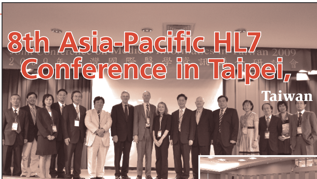
Opening Ceremony: Organizing Committee members and invited international speakers.