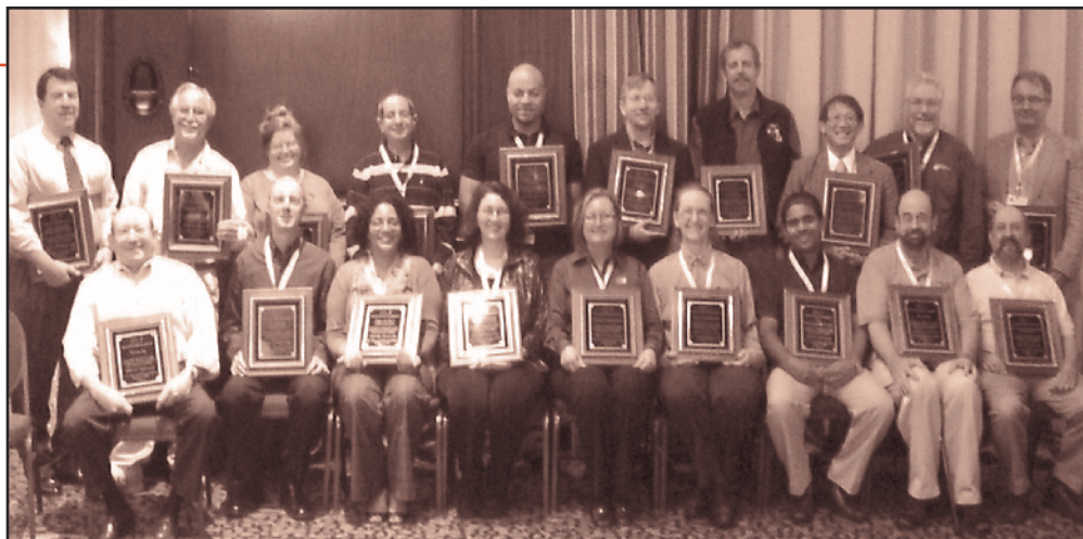
The 2009 HL7 Benefactors

Throughout the last 13 years, HL7 has recognized 52 incredibly dedicated volunteers that have played vital roles to the success of HL7. We sincerely appreciate their contributions and dedication to HL7 and the industry. It has been years since we've recognized all Volunteer of the Year Award winners; therefore, on behalf of the HL7 Board and entire organization, I am pleased to once again thank and recognize all 52 individuals listed below by year.