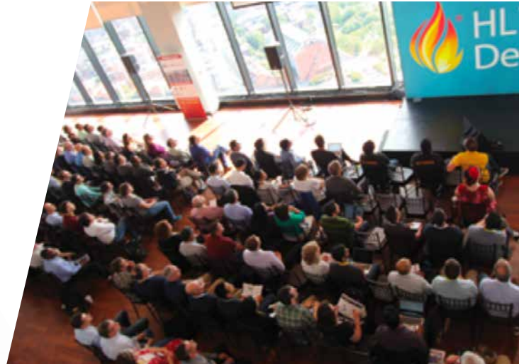
OUR 2019 HL7 FHIR DEV DAYS EVENT